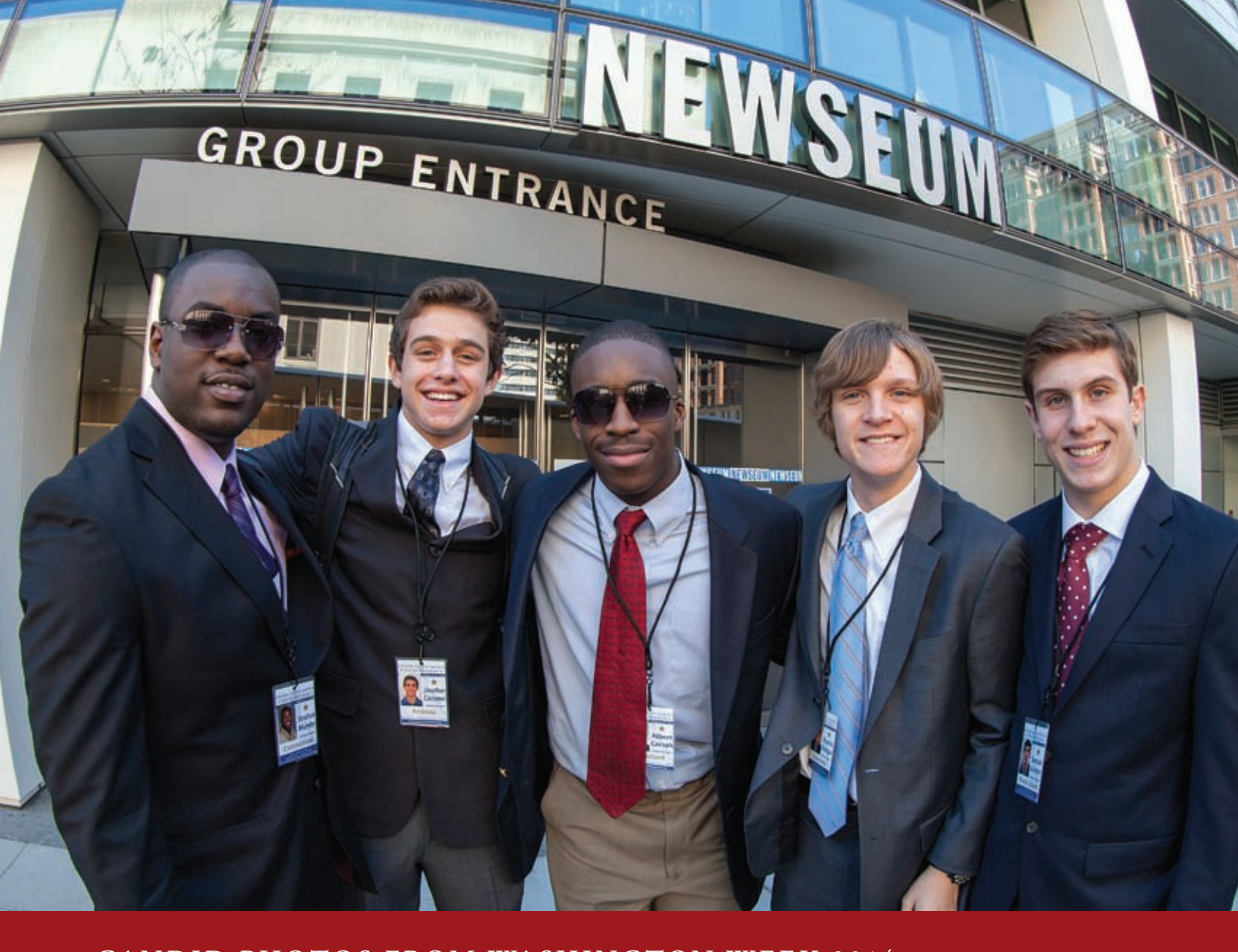
CANDID PHOTOS FROM WASHINGTON WEEK 2014