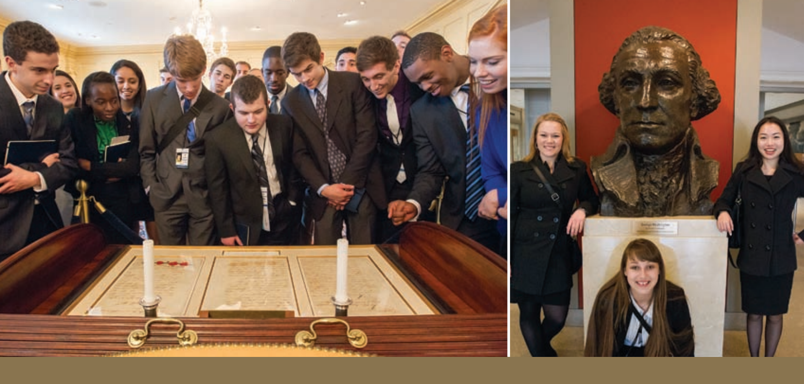
DELEGATES TOURED HISTORIC SITES IN THE NATION'S CAPITAL